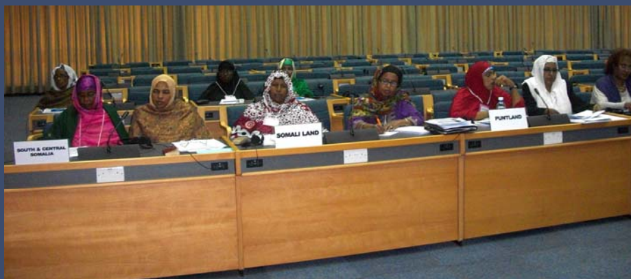
Participants during the three-day gender workshop held in Nairobi

After the launch, the Independent Federal Constitution Commission (IFCC) was to ensure that the Somali community inside Somalia and in the Diaspora was given the opportunity to present their views and recommendations to be incorporated in the final document. The Commission, for its part, is tasked with working with Civil Society Organizations (CSO) to carry out Civic Education, Public and Political Consultations countrywide and in the Diaspora ■