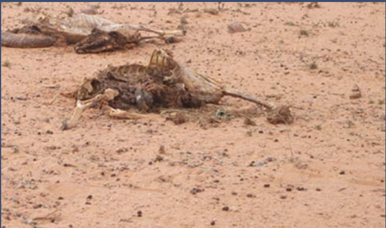
The devastating effects of the current drought in Somalia

The drought is not only affecting South Central Somali but also Puntland and Somaliland. The UN, Common Humanitarian Fund (CHF) has released US $4.5 million to assist the affected areas. The main sectors identified for immediate interventions with these funds are Livestock, Agriculture, Nutrition and Water/Sanitation. ■