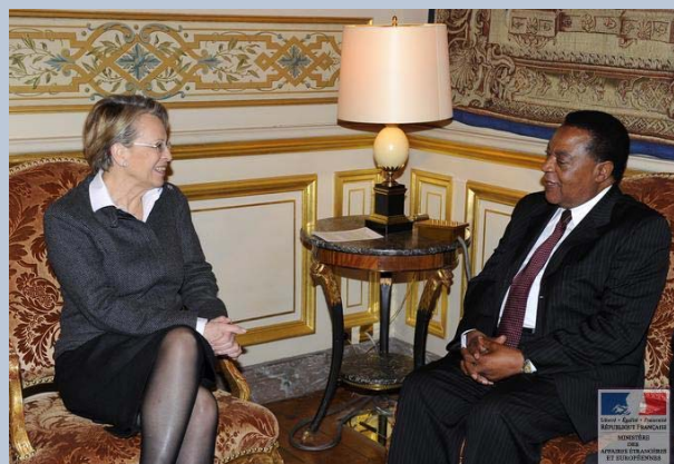
Ambassador Augustine P. Mahiga met with the former French Foreign Minister, Alliot-Marie in Paris to discuss issues on Somalia on 15 February 2011

The TFG leadership was further urged to strengthen ties with Somaliland and Puntland so as to prevent terrorists from infiltrating the two regions. The Cabinet was also asked to swiftly complete the remaining tasks of the transition including the drafting and approval of the Constitution, providing livelihood to the population and expanding the authority of the State.