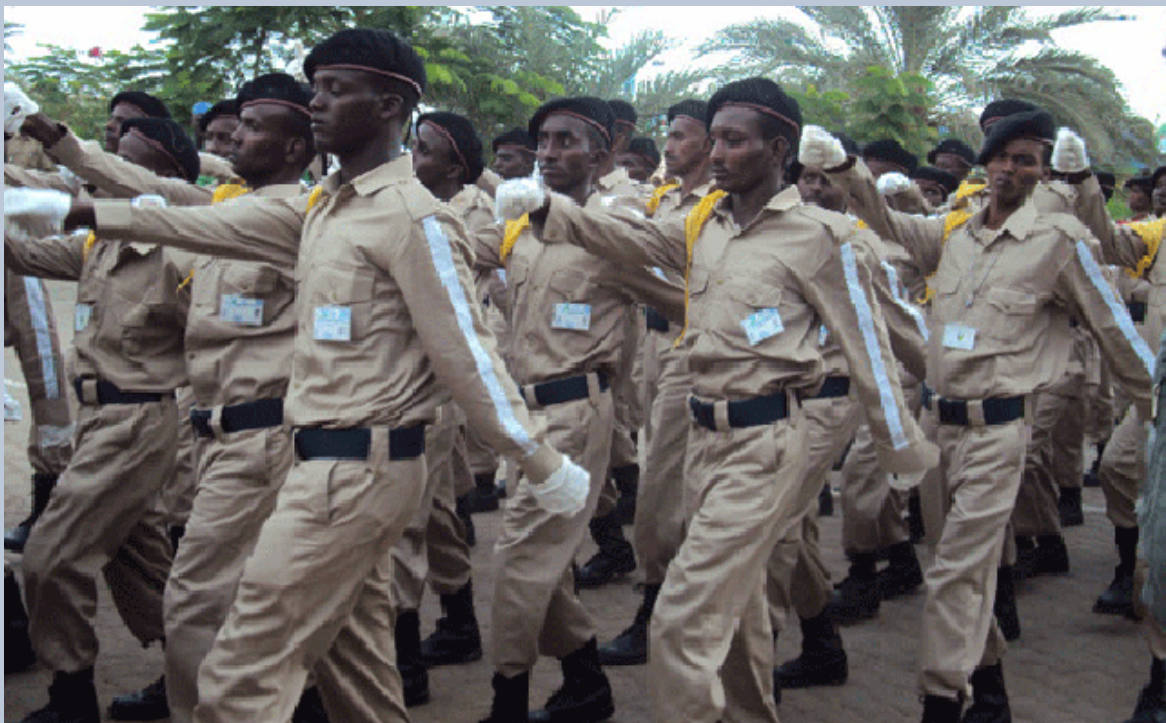
Somali police trainees march at Idriss Farah Abaneh Police Academy during the inauguration ceremony

At a press conference following the ceremony, the SRSG emphasized that "The security process is a long-term one. It is one of the essential tasks of the TFG to gain legitimacy, trust and credibility of its citizens as well as the International Community ." ■