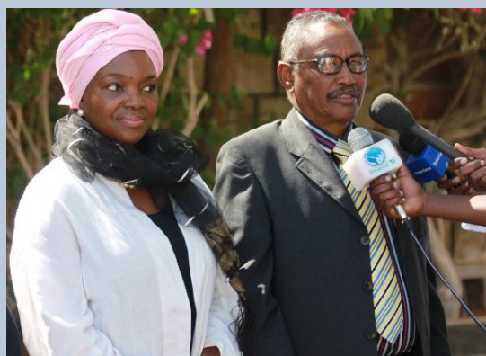
United Nations Under-Secretary-General for Humanitarian Affairs and Emergency Relief Coordinator, Ms. Valerie Amos, meets with Puntland officials on 2 February 2011 to discuss humanitarian issues in the region