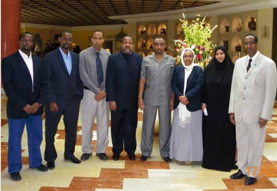
Preparatory workshop for Somali authorities held from 15 to 17 February 2011 in Djibouti