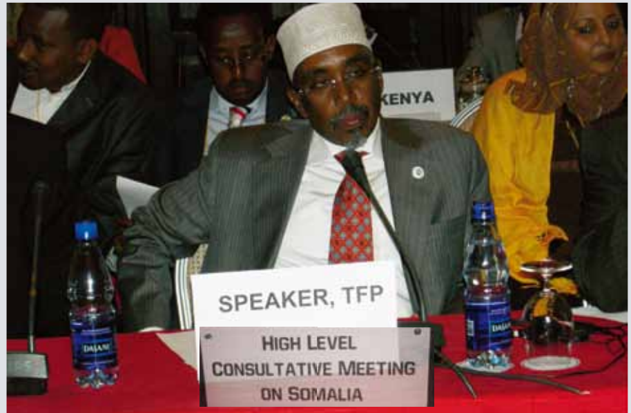
Somali delegates during the High Level Consultative Meeting

During the closed door meeting, stakeholders discussed several critical issues of concern including what action to take in light of the end of the Transition period in August 2011 as envisioned in the Transitional Charter. There was a dis-