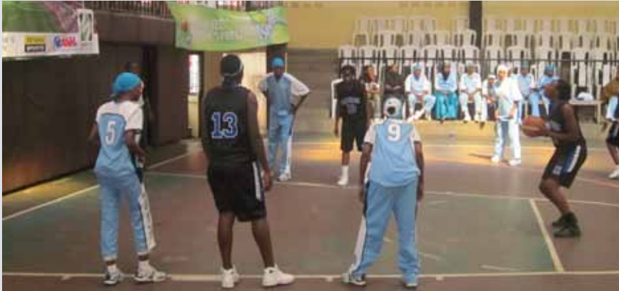
Mogadishu City Ladies Basketball Team playing against Nairobi Girls Team

Claps and cheers filled the air as the girls entered the gymnasium amid a huge crowd of fans. This basketball match in April was something special. For the first time in two decades, the basketball fraternity in Kenya witnessed the participation of a team from Somalia. What is more, it was an all-girls team. The young women came from Mogadishu to Nairobi to participate in the East and Central Africa Inter-Cities Tournament, an international event held at the Nyayo National Gymnasium, Nairobi.