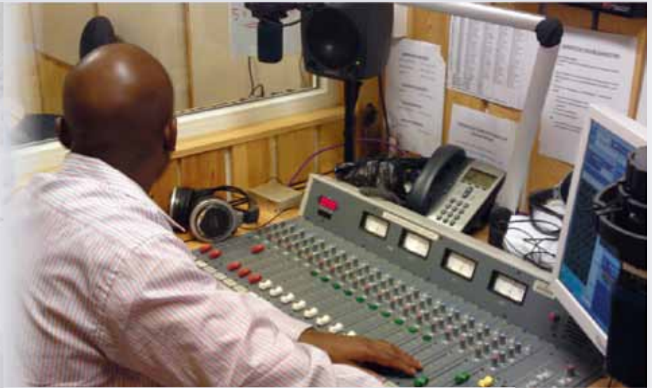
Radio Barkulan's studio in Nairobi

The daily religious program advocates a peaceful co-existence among the various factions in Somalia through quotes and verses from the Holy Quran and Hadith. Hadith are sayings of the Prophet Muhammed. "Every week we invite a Sheikh to read and translate verse from the Holy Quran, as most Somalis do not understand Arabic. There are also discussions in which listeners are given a chance to call in and ask the Sheikh to