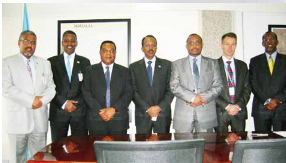
TFG meeting UNPOS

coast of Somalia which, among other things, proposes setting up two courts inside Somalia (Somaliland and Puntland) and one outside Somalia, which specialize in trying suspected pirates. The initiative was proposed by Jack Lang, the Special Adviser on Legal Issues Related to Piracy off the Coast of Somalia in his report (25 January 2011). The Security Council requested that the United Nations Secretary-General assess the establishment of such courts and reports back to the Security Council within two months of the adoption of the resolution. The recommendation from the Office of Legal Affairs has been submitted to the Security Council.