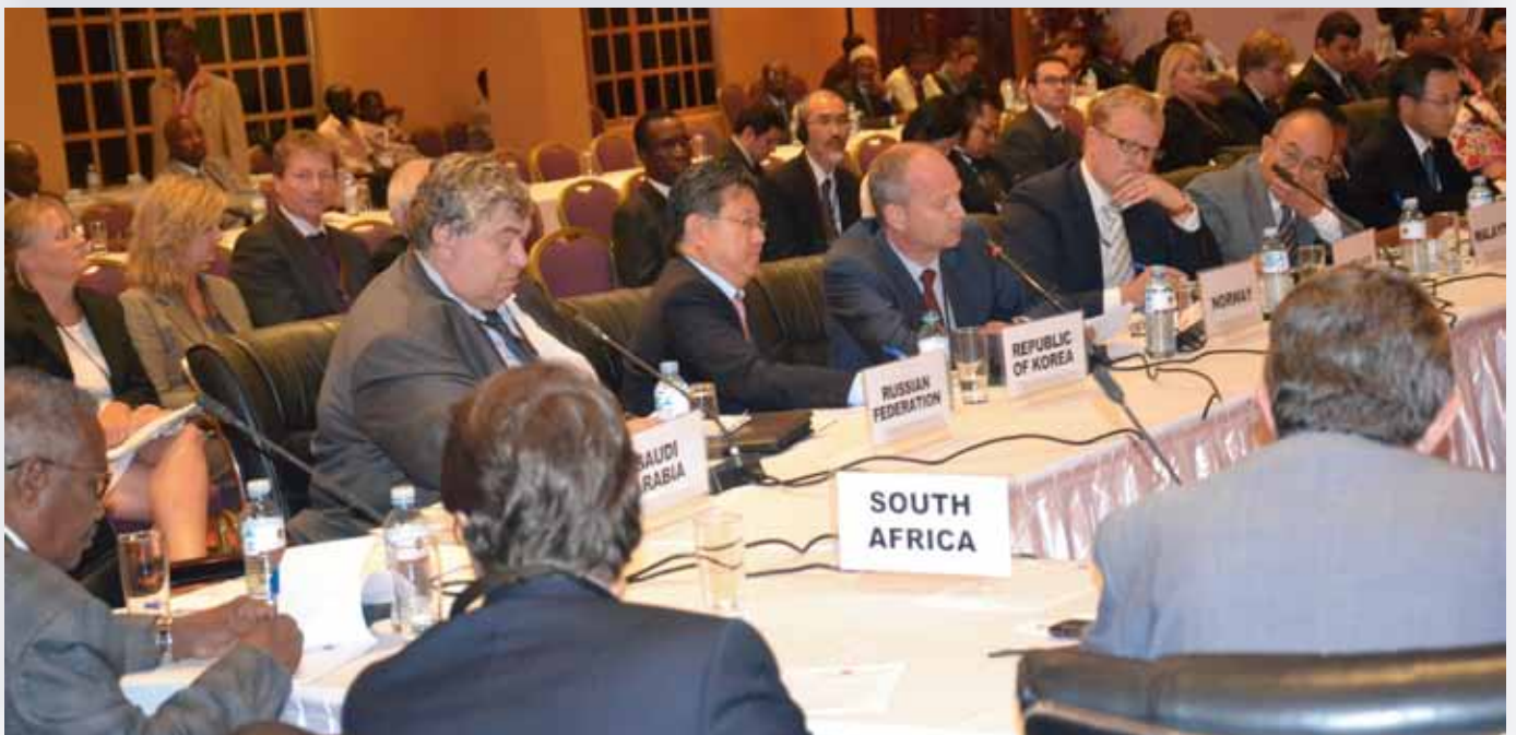
Participants at the International Contact Group in Kampala

SRSG Mahiga told the meeting that in order to ensure that the Government institutions carried out priority tasks such as finalizing the constitution he proposed that they "agree on a set of implementable benchmarks, timelines, a monitoring mechanism and mutual obligations in achieving the transitional tasks." ↗