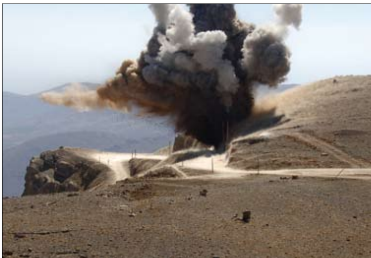
Blasting of the hanging Rock "Felsenkopf" in the AOR of the 1st Coy