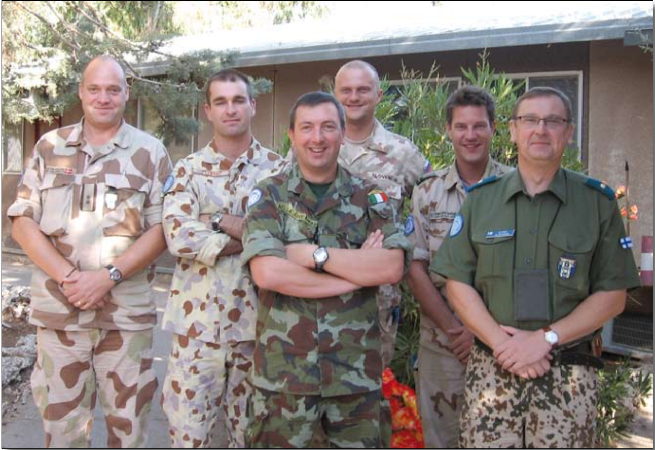
OGG Staff as of September 2007