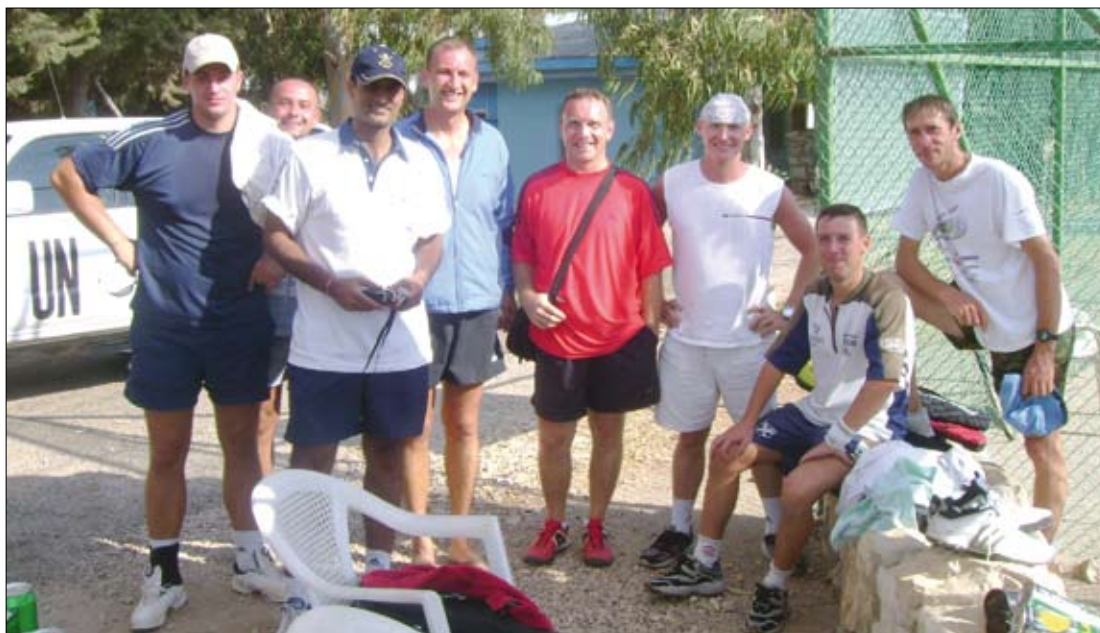
Satisfied through tough and serious but fair fights looking forward together to the “Apres Tennis Party!” at SLOVCON POS 10

fet. Where also took, after tournament evaluation, place the handing over of prizes and honouring of the winner. In the evening all participants were invited for a barbecue reception and „Apres Tennis Party“ at Posn 10.