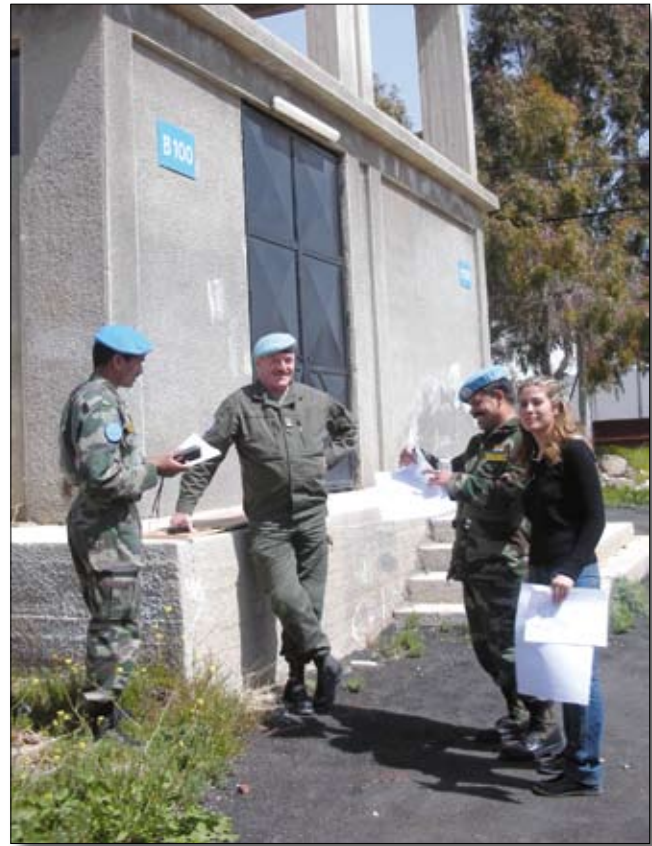
GPS training - Camp Faouar, spring 2007

“Saladin North”, tracking of the new road and assigning locations for barrels like Oscar V to VIII in “Saladin South” and assigning locations for barrels to represent the