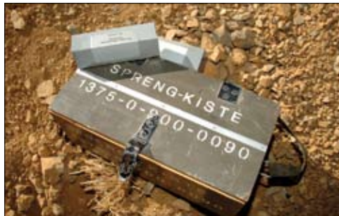
Duty-box with detonators and high explosives

One of the main tasks is certainly the checking of patrol roads and patrol ways. This exigent operation claims 100 percent concentration from the searcher. The metal detector releases different altitudes of sound depending on the amount