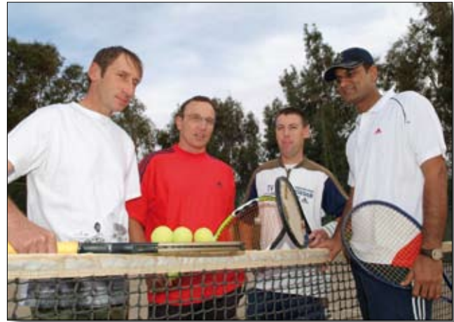
International friendship lived through the spirit of sport

SLOVCON has decided to organize a tennis tournament. The main goal was to built up good relationship between contingents within UNDOF. As well as making the