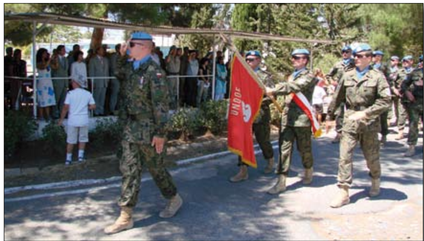
Presenting the banner to the honorary guests marching by the tribune

After his speech there was a ceremony of decorating soldiers with UNDOF Medals and troops march accompanied by vehicles parade, which ended the celebration. The UNDOF Medal given to Polish soldiers has a UN logo on avers, and colors of its ribbon have their own symbolic. The shade of Burgundy symbolizes the purple haze at sunset and of the native thistle and the flora on the Golan. White indicates the snow on Mt Hermon. Black acts for the volcanic rocks and stones on the Golan Heights. The Blue band with the Red line is representa-