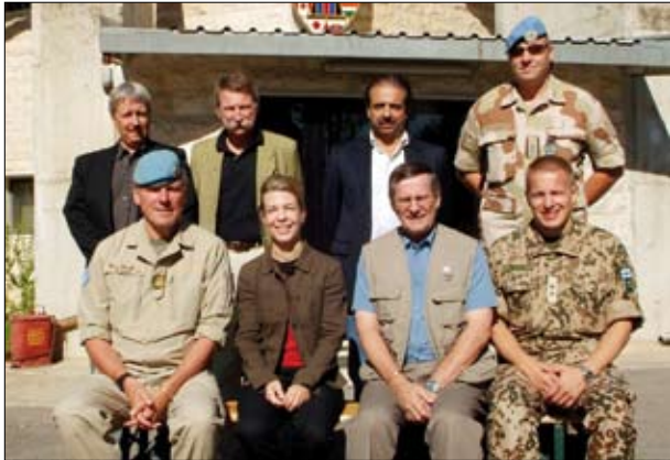
Visit of a mission evaluation team led by General (Retd.) Maurice Baril, evaluating the UNDOF activities (24 th Sep 2007)