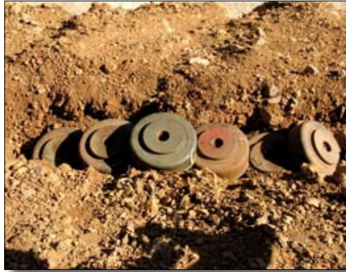
Six antitank mines before blasting