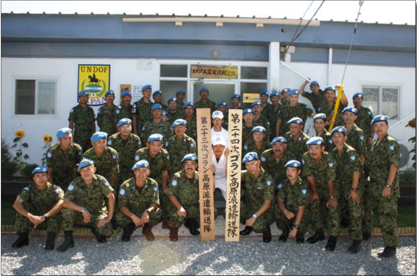
COC of J-CON (5 th Sep 2007): 24 th J-CON UNIT PLATE has been handed over at 1400 hrs on 5 th Sep 2007

The J-CON Change of Command ceremony was held in CZ on 5 th Sep 2007.